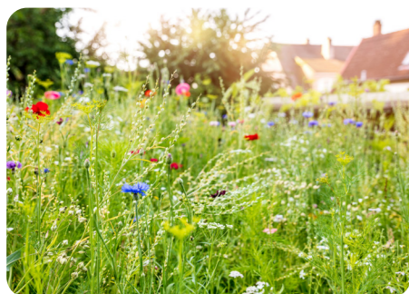
wild, uncut areas