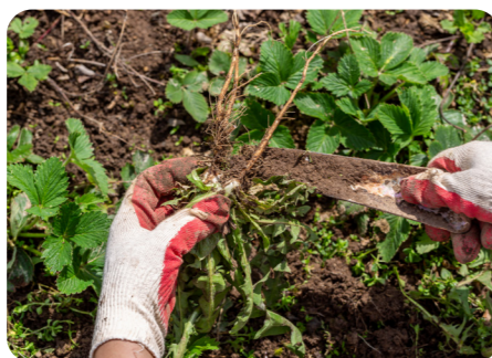
weeding by hand