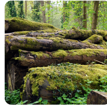
under logs and stones