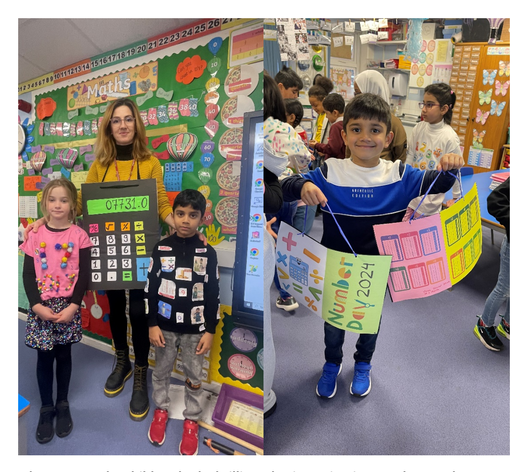
In key stage 1 the children had a brilliant day investigating numbers and patterns.